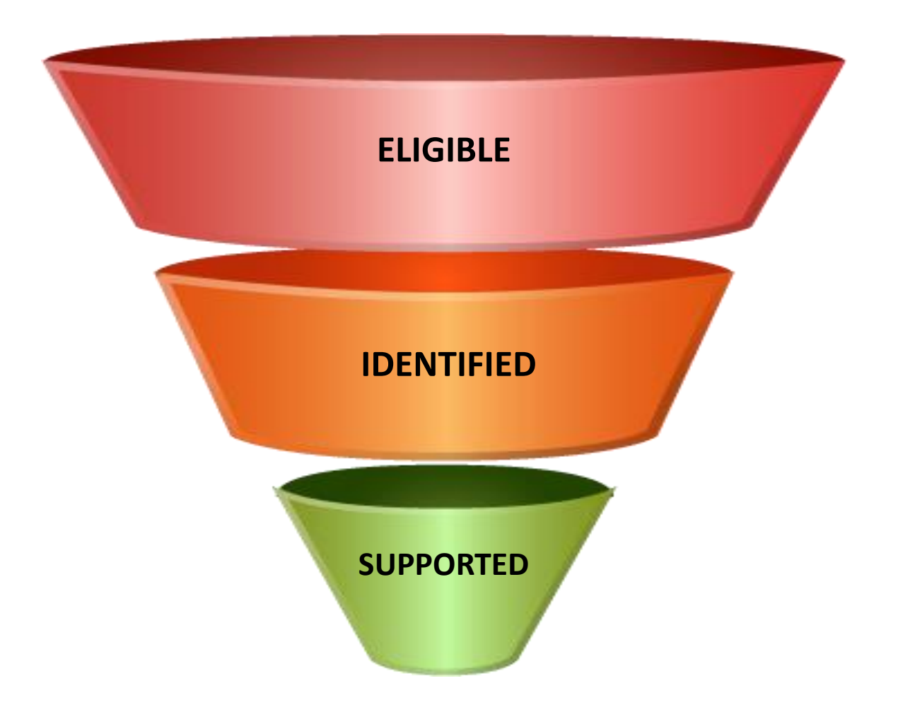
Figure 5.1: The reach of energy efficiency policies