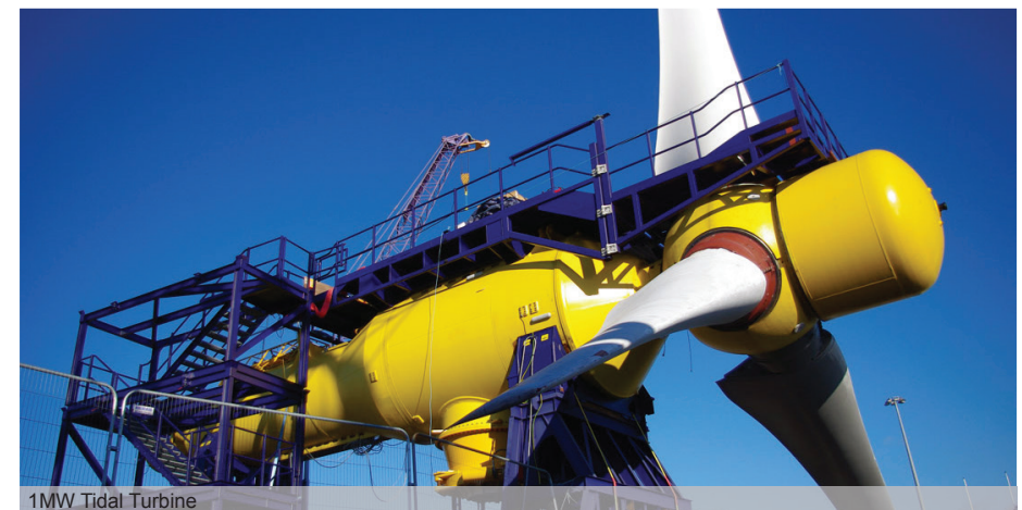
1MW Tidal Turbine