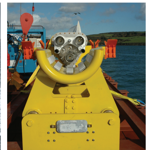
11kV Wet-mate Connector