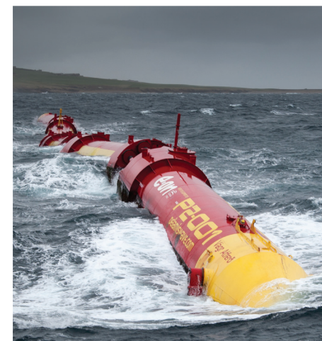
Wave Energy Converter