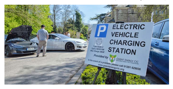
Figure 4: Gwent Energy CIC's EV Open Day 2019

Apart from word of mouth, Gwent Energy's marketing strategy hinges on raising its profile locally, and it organises numerous events (Figure 4), including a free tour of an Energy Recovery Facility and an EV opening day (Gwent Energy CIC, 2019h). An example helps to illustrate how successful these events have been at generating custom: Gwent Energy CIC and Transition Chepstow organised an event entitled "Does Battery Storage Work?" in June 2016. Speaking afterwards, the CIC's director speculated that "the day is likely to generate 6 orders for PV with batteries and 2 orders for batteries alone" (Clatworthy, 2016: 6).