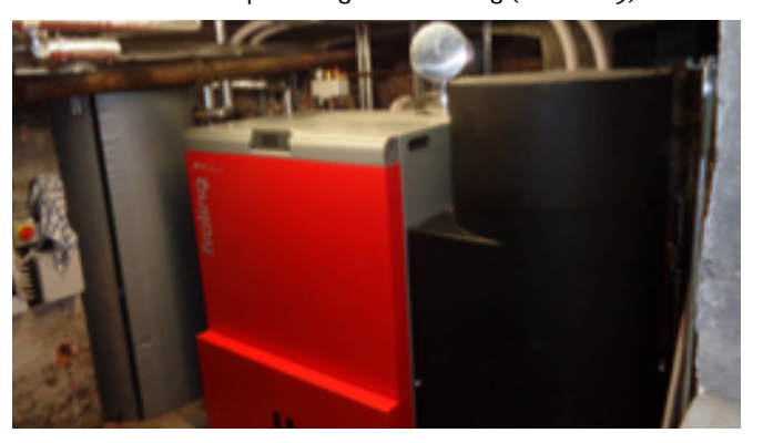
Figure 6 – Gwent Energy installed 100 kW biomass boiler at Wellington Baptist church and community centre (Gwent Energy CIC, 2019c)

Gwent Energy has also installed and owns one 100 kW woodpellet biomass boiler in a community centre, which replaced the "very old oil boiler" in the property (Community Energy Hub, 2015) (Figure 6). The new boiler generates about 60,000 MWh per year (115). This is roughly equivalent to about five average sized households' consumption of gas for heating (BEIS 2019).