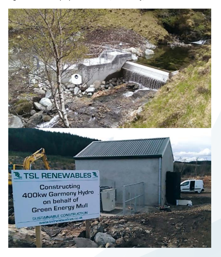
Figure 2: Garmony Hydro Scheme (MICT, 2019)

Members of the community energy group were not fixed on any particular renewable technology. In the end, a run-of-the-river hydro facility was chosen for several reasons (Figure 2).