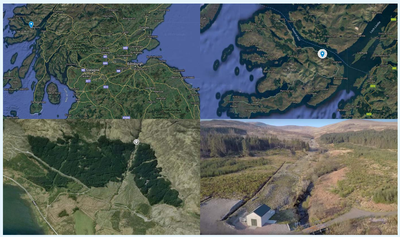
Figure 1: GEM project location

GEM is a Community Benefit Company (BenCom) that owns and operates Garmony Hydro. It is a run-of-the-river hydro scheme, located near the east coast of the island of Mull, part of the Inner Hebrides of Scotland (Figure 1). The "overriding" purpose of GEM is the creation of a revenue stream for investment in "long term transformational sustainable change" for the islands of Mull, Iona and smaller neighbouring islands (I21).<sup>2</sup> Making a positive contribution to the environment is an important albeit secondary objective (l21).